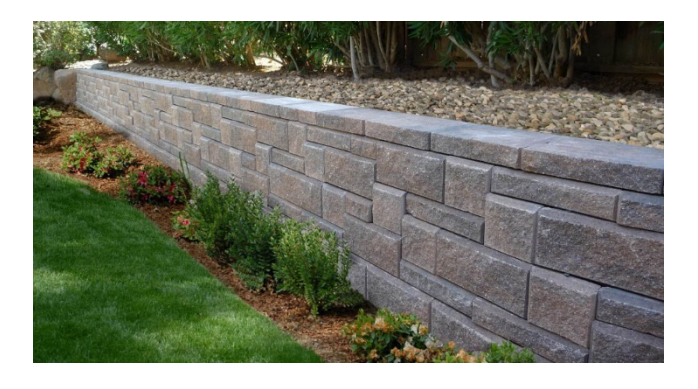
Visit www.mtlebanon.org for more information